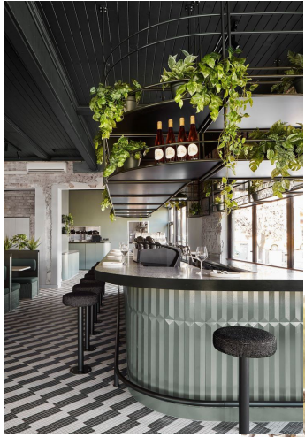
peace and coffee